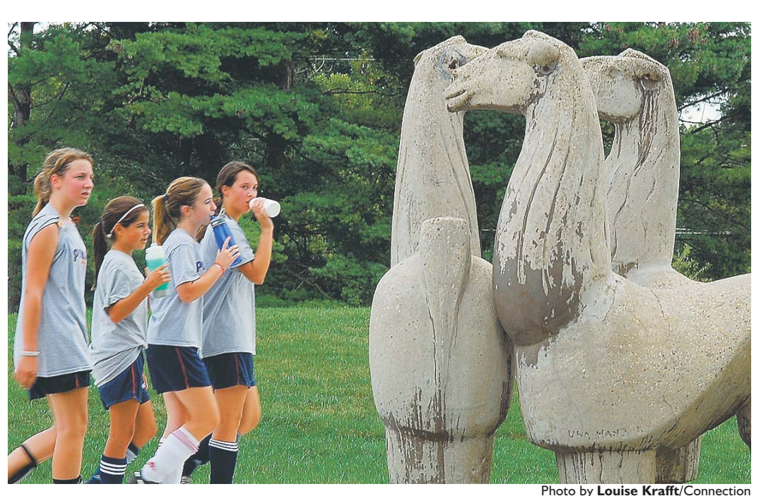
Upper school students return from a field hockey practice.

Vienna/Oakton Connection • September 2009 • A* Education, Learning, Fun • Camps & Schools • 5