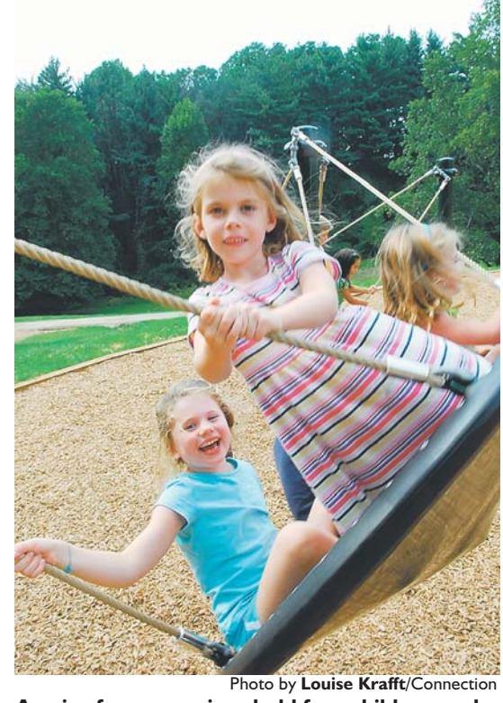
A pair of saucer swings hold four children each in the new Potomac School playground.

4 ● A* Education, Learning, Fun ● Camps & Schools ● September 2009 ● Vienna/Oakton Connection